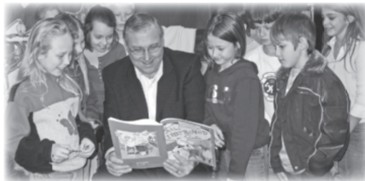
T.E. Baxter Elementary students were delighted to have Dr. Kennedy read to them.

The best way to truly evaluate TAKS performance of a school system is to go beyond the rating given by the state accountability system. What is the overall percent passing rate in different subject areas? What is the level of