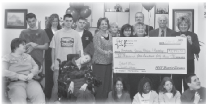
MHS Community Based Instruction class was recently awarded a $2,443.37 for the School House Candle Shop grant.

MEF accepts personal donations, gifts from estates and trusts, in-kind contributions. Send contributions to MEF, P.O. Box 1906, Midlothian, TX. For more information visit www.midlothian-isd.net/mef .